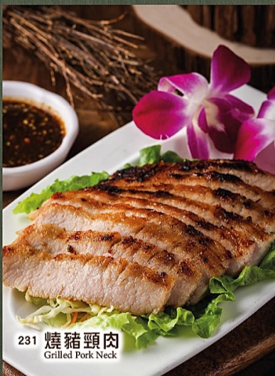
231 燒豬頸肉 Grilled Pork Neck