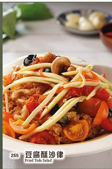
255 豆腐酥沙律 Fried Tofu Salad