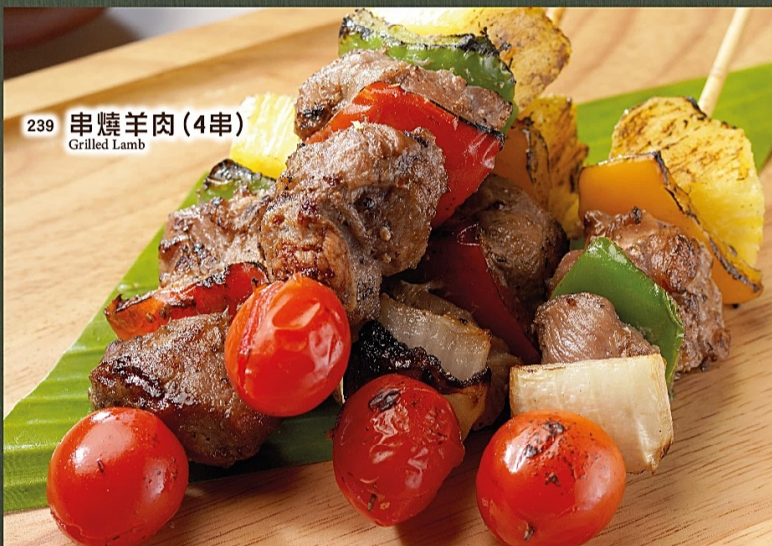
239 串燒羊肉(4串) Grilled Lamb