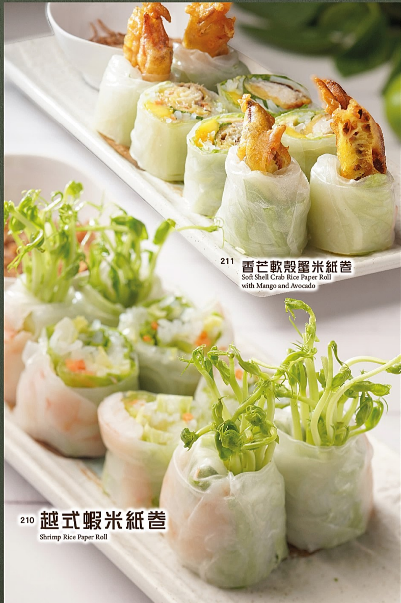
211 香芒軟殼蟹米紙卷 Soft Shell Crab Rice Paper Roll with Mango and Avocado