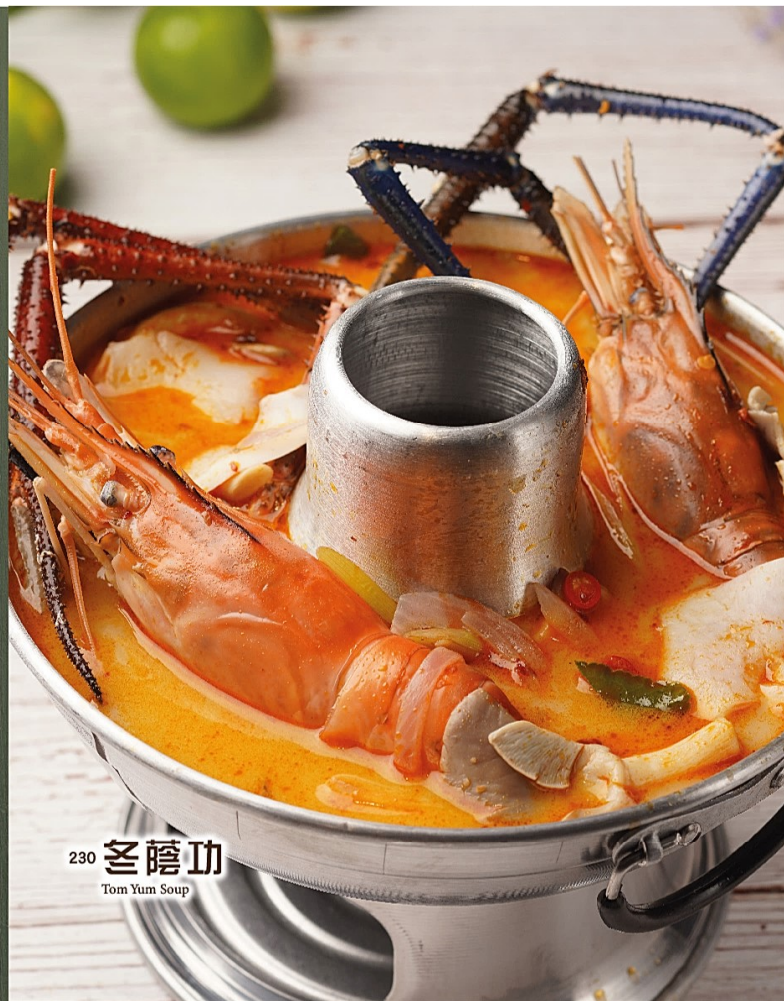
230 冬蔭功 Tom Yum Soup