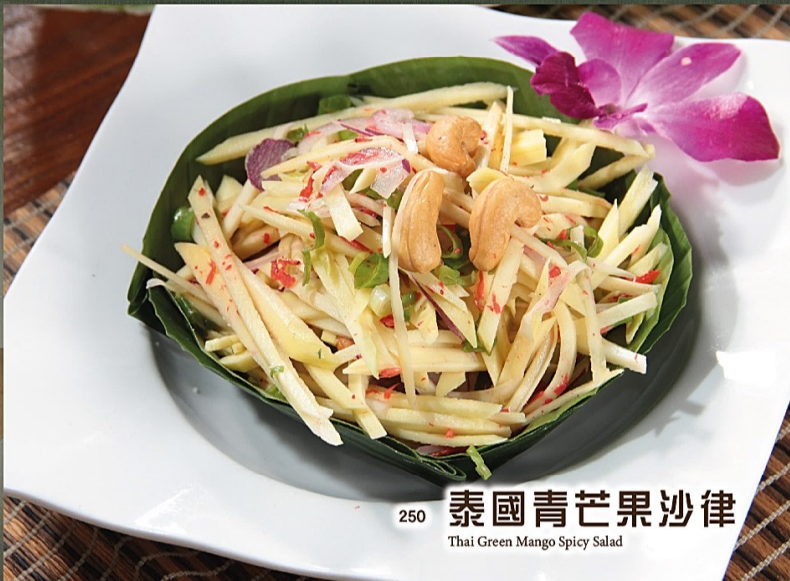
250 泰國青芒果沙律 Thai Green Mango Spicy Salad