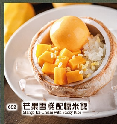
602 芒果雪糕配糯米飯 Mango Ice Cream with Sticky Rice