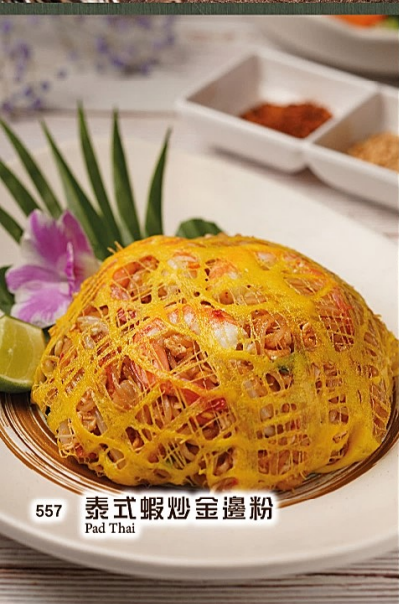
557 泰式蝦炒金邊粉 Pad Thai