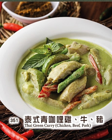
351 泰式青咖喱雞、牛、豬 Thai Green Curry (Chicken, Beef, Pork)