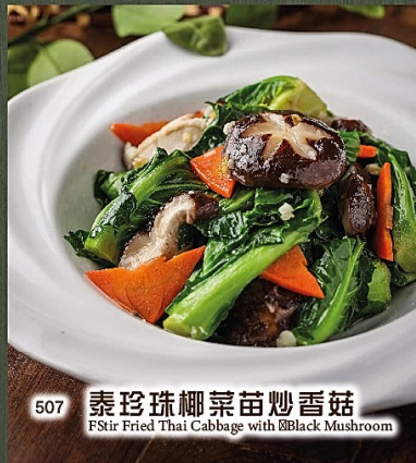
507 泰珍珠椰菜苗炒香菇 FStir Fried Thai Cabbage with Black Mushroom