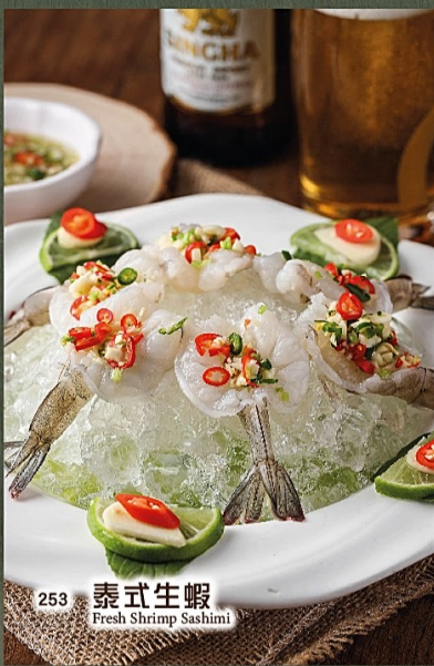
253 泰式生蝦 Fresh Shrimp Sashimi