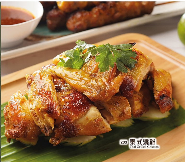
233 泰式燒雞 Thai Grilled Chicken