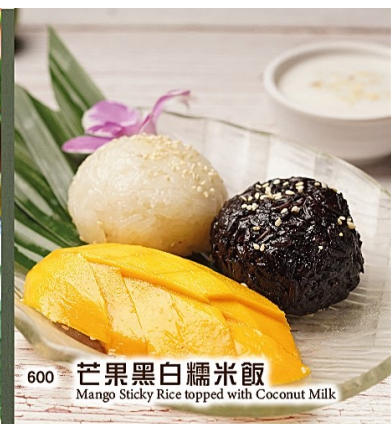
600 芒果黑白糯米飯 Mango Sticky Rice topped with Coconut Milk