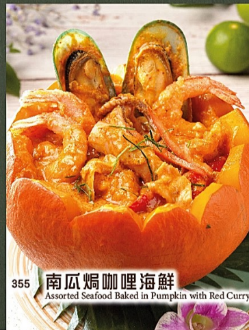
355 南瓜焗咖喱海鮮 Assorted Seafood Baked in Pumpkin with Red Curry