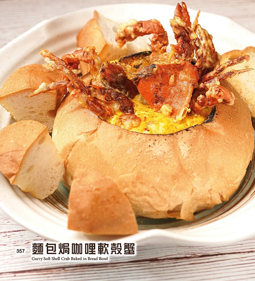
357 麵包焗咖喱軟殼蟹 Curry Soft Shell Crab Baked in Bread Bowl