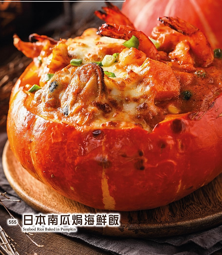
555 日本南瓜焗海鮮飯 Seafood Rice Baked in Pumpkin