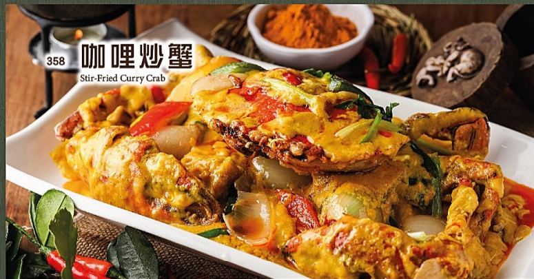
358 咖喱炒蟹 Stir-Fried Curry Crab