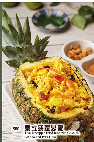
550 泰式菠蘿炒飯 Thai Pineapple Fried Rice with Chicken, Cashew and Pork Floss