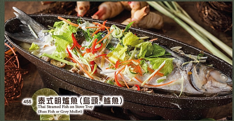
455 泰式明爐魚 (烏頭, 鱸魚)

Thai Steamed Fish on Stove Tray (Bass Fish or Grey Mullet)