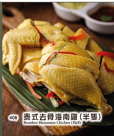
408 泰式去骨海南雞 (半隻) Boneless Hainanese Chicken (Half)