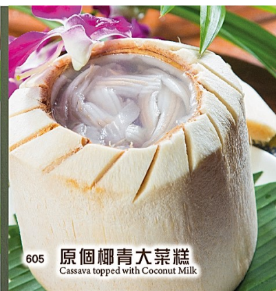
605 原個椰青大菜糕 Cassava topped with Coconut Milk