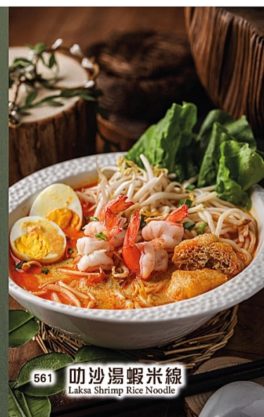
561 叻沙湯蝦米線 Laksa Shrimp Rice Noodle