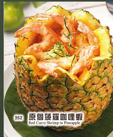
352 原個菠蘿咖喱蝦 Red Curry Shrimp in Pineapple