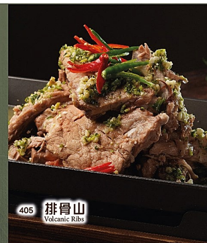
405 排骨山 Volcanic Ribs