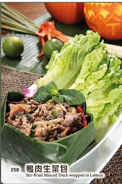
258 鴨肉生菜包 Stir-Fried Minced Duck wrapped in Lettuce