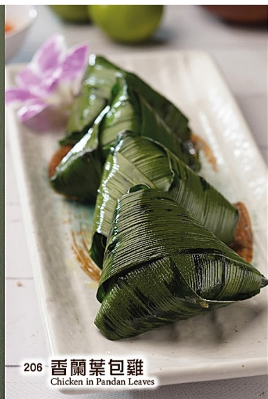
206 香蘭葉包雞 Chicken in Pandan Leaves