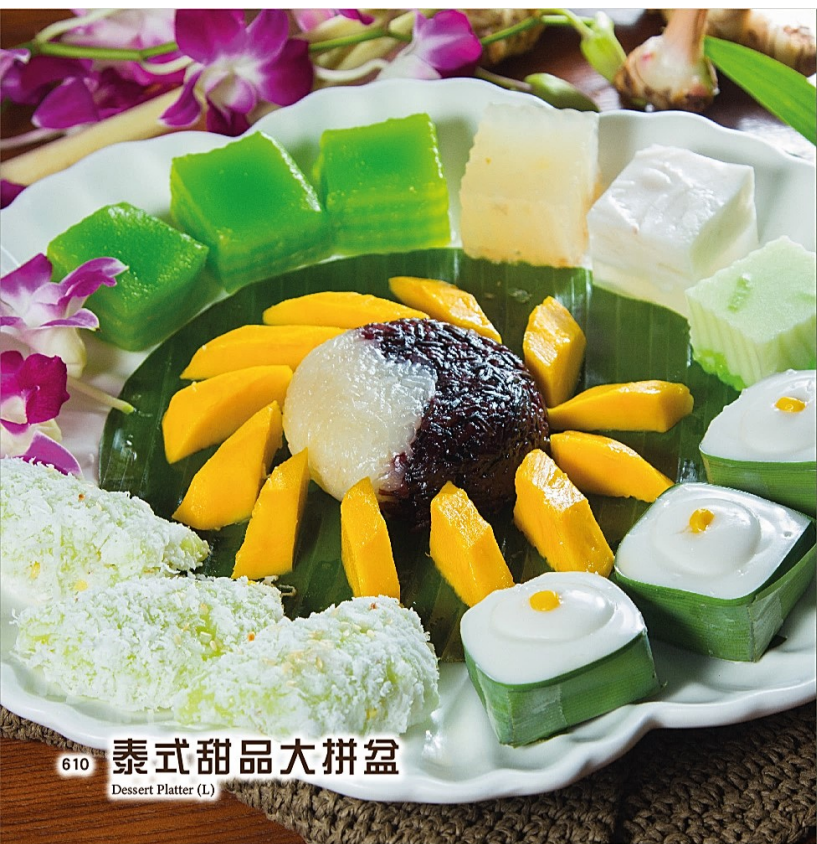
610 泰式甜品大拼盆 Dessert Platter (L)