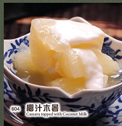
604 椰汁木薯 Cassava topped with Coconut Milk