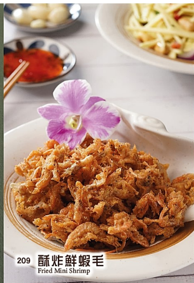
209 酥炸鮮蝦毛 Fried Mini Shrimp