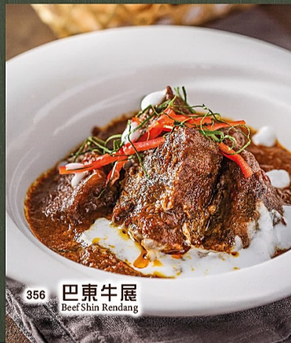
356 巴東牛展 Beef Shin Rendang