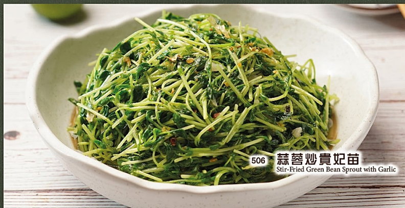
506 蒜蓉炒貴妃苗 Stir-Fried Green Bean Sprout with Garlic