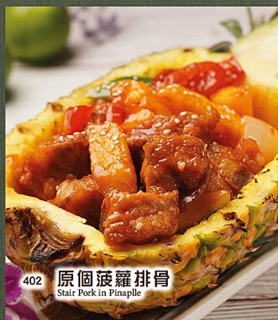
402 原個菠蘿排骨 Stair Pork in Pineapple