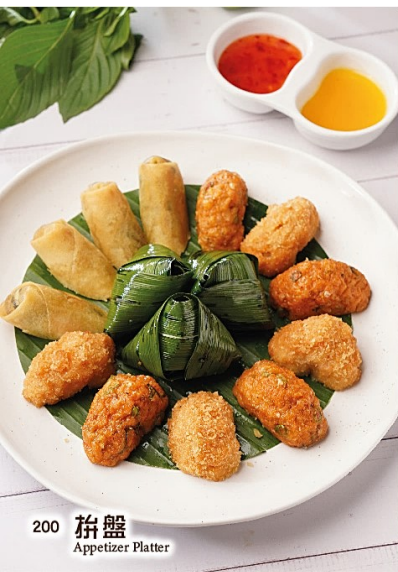
200 拚盤 Appetizer Platter