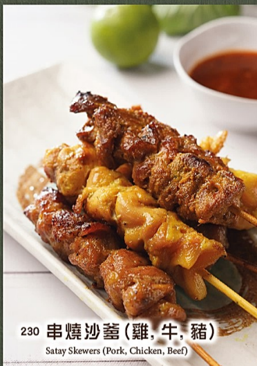
230 串燒沙嗲(雞, 牛, 豬) Satay Skewers (Pork, Chicken, Beef)