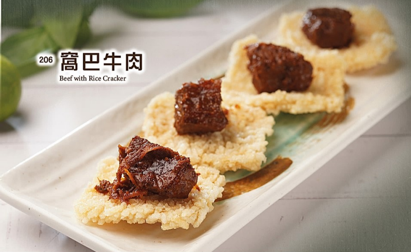
206 窩巴牛肉 Beef with Rice Cracker