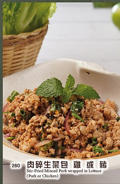
260 肉碎生菜包 雞 或 豬 Stir-Fried Minced Pork wrapped in Lettuce (Pork or Chicken)