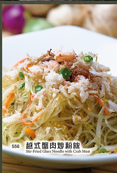
556 越式蟹肉炒粉絲 Stir-Fried Glass Noodle with Crab Meat