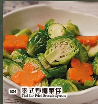
504 泰式炒椰菜仔 Thai Stir-Fried Brussels Sprouts