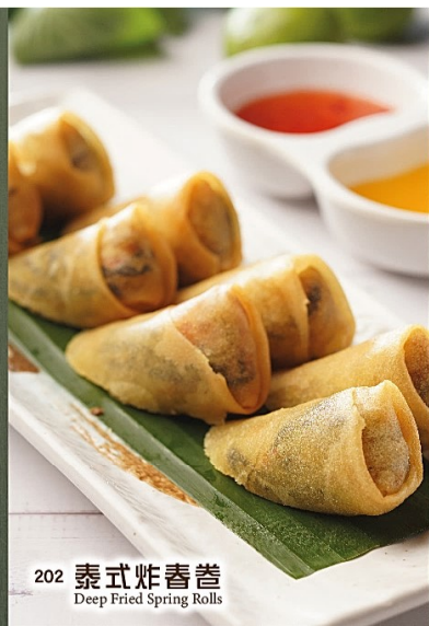
202 泰式炸春卷 Deep Fried Spring Rolls