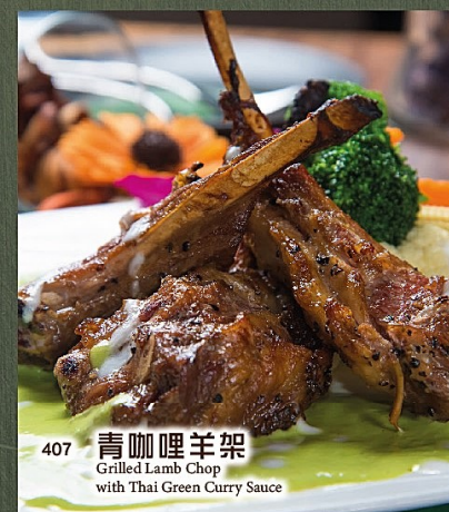
407 青咖喱羊架 Grilled Lamb Chop with Thai Green Curry Sauce