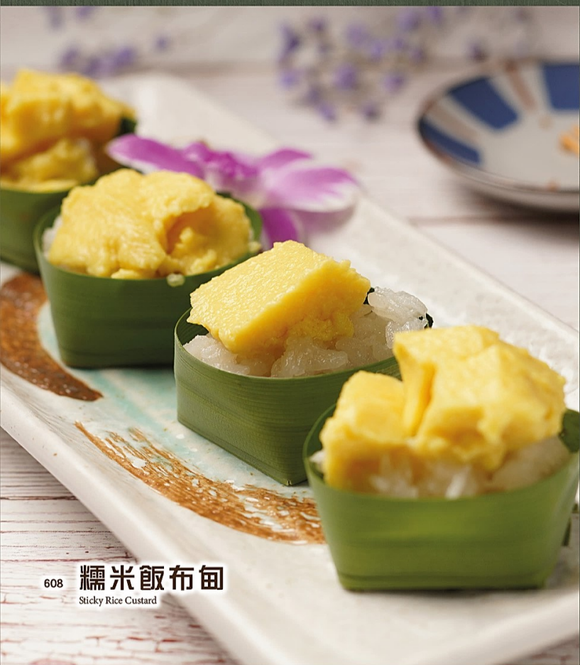
608 糯米飯布甸 Sticky Rice Custard